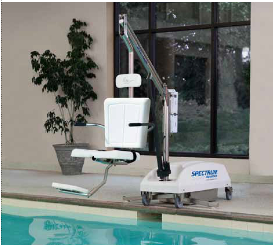
PORTABLE POOL LIFTS